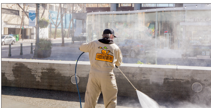
PBID renewal will expand the Groundwerx program throughout downtown.