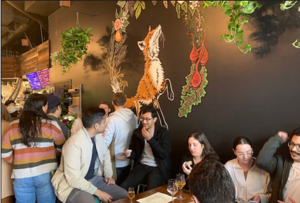
The Fox Tale crowd

Fox Tale creates stir on Santa Clara Street: Fox Tale Fermentation Project at 30 East Santa Clara St. held its soft opening over a full week in April – often resulting in lines out the door of patrons eager to try the specialty beers, fermented foods and non-alcoholic beverages like Kombucha tea. The business bloomed from the combined entrepreneurial dreams of two people with similar