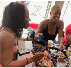
Diners at Island Taste

Eat like you're on vacation: Island Taste Caribbean Grill is now open on Santa Clara Street, just across the street from City Hall, serving up authentic dishes from Ja-