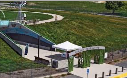
The Rotary PlayGarden at 438 Coleman Ave.

Construction begins on Rotary PlayGarden expansion: Seven years after the completion of the Rotary PlayGarden, San Jose's first all-inclusive playground, construction begins on its expansion. The original