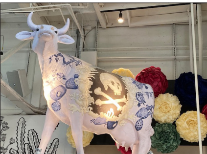
Alma's divine bovine

Tequila-sipping at San Pedro Square: Alma Tequileria is now open in San Pedro Square Market, offering a wide selection of Tequila, Mezcal, Sangrita, and Mexican beers. Signature cocktails were locally inspired with