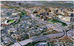
Cisco Park would have been A's home.

However, the ballpark land acquisitions paved the way for Google's exclusive negotiations with the city for the