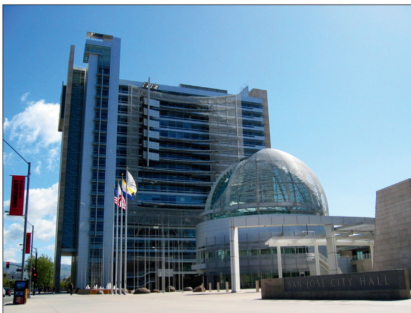
City Hall returned to downtown San Jose in 2005 after a 50-year absence.

SharkByte – Modeled after the 1998 "Cows on Parade" introduced in Zurich and adapted in New York City, Chicago and other U.S. cities, San Jose put sharks on exhibit during SharkByte. One hundred artists were each paid $1,000 to transform life-sized fiberglass sharks into works of art through painting, sculpture, metal work and textiles. In August 2001, the finished works were put on display. Each shark was sponsored by a beneficiary organization that would receive proceeds from the sale of "their shark" at an auction scheduled for November. However, the auction was postponed to March 2002 because of the Sept. 11, 2001, terrorist attacks on the U.S. and the lingering economic downturn. The auction of 99 sharks raised $285,000 and the top