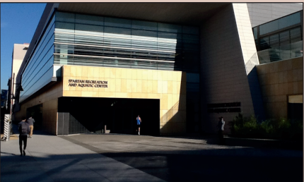
SJSU's Recreation and Aquatics Center keeps students active in downtown San Jose.

Opened in April, the center features indoor track, spacious three-court gym, exercise machines, rock-climbing apparatus, quiet lounges and outdoor lap and recreational pools.